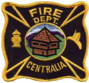
City of Centralia