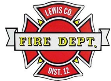
Lewis County F.D. #12